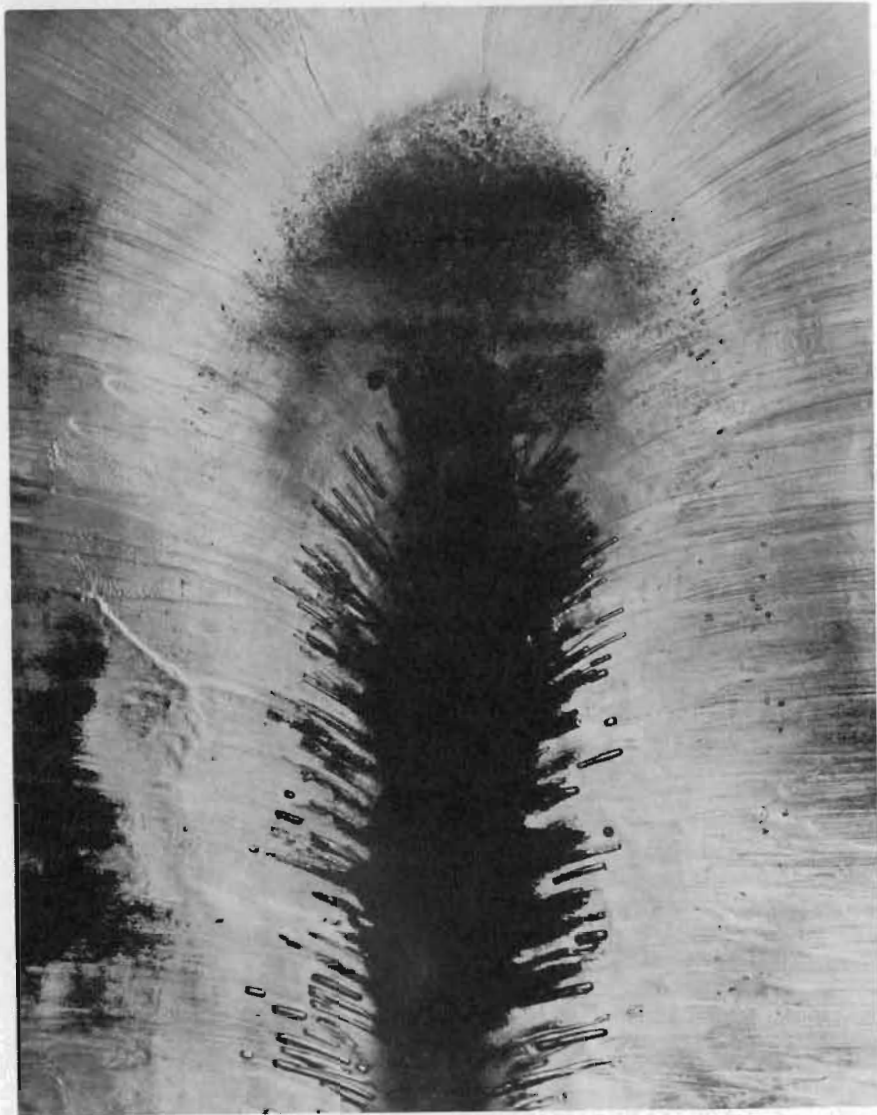
"Ice" Honor Award